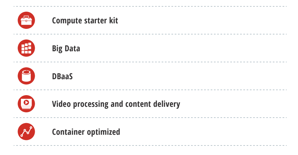
Figure 8. Example Sample Configuration: Web Services and Ecommerce